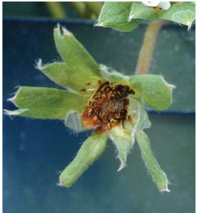
Figure 4. Anthracnose flower blight