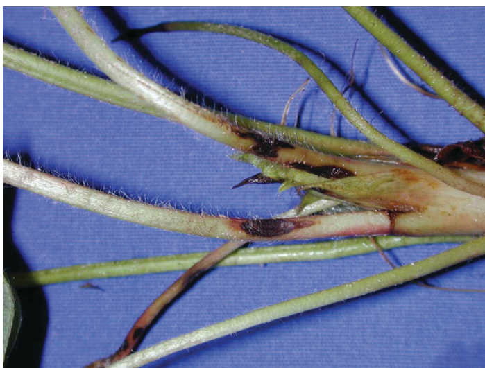
Figure 3. Anthracnose lesions on petioles

C. acutatum appears to spread first on the foliage, often without causing visible symptoms. A few conidia (asexual spores) are formed on green leaves and petioles, and more are produced as the tissue ages and dies. Conidia are moved from the foliage to the flowers and fruit primarily by splashing water. They then germinate and infect. Developing infections on flowers and fruit produce abundant conidia that are spread to other plants and fields by equipment and harvesters, especially when the plants are wet.