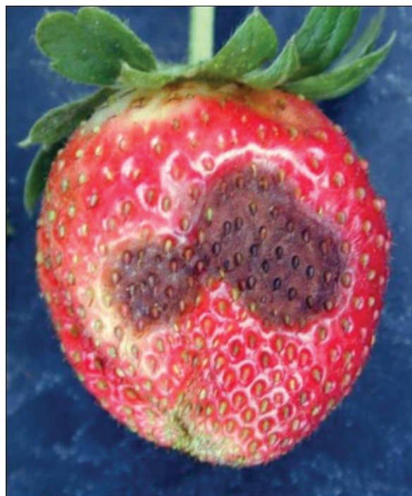
Figure 1. Anthracnose lesions on a ripe fruit

Anthracnose fruit rot lesions appear as dark, sunken spots on infected fruit (Figure 1). On green fruit, anthracnose lesions are small ( \frac{1}{16} – \frac{1}{8} inch across), hard, sunken, and dark brown or black. Lesions on ripening fruit are larger ( \frac{1}{8} – \frac{1}{2} inch), hard, sunken, and tan-to-dark brown. During wet weather, the lesions become covered with sticky, light orange ooze composed of millions of spores (conidia) in a mucilaginous matrix (Figure 2). When conditions are favorable for infection, multiple lesions nearly cover the fruit, and lesions may appear on petioles (Figure 3). Strawberry flowers are highly susceptible and turn brown and remain attached to the plant when infected (Figure 4). Flowers affected by the gray mold fungus Botrytis cinerea may show similar symptoms. Small black spots on green button-sized fruit may also develop from flower infections (Figure 5).