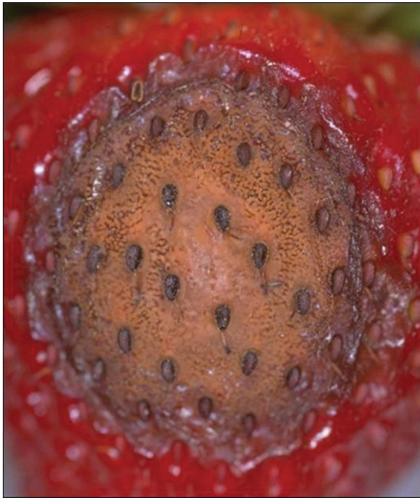
Figure 2. Spore mass of C. acutatum on anthracnose lesion

present on the foliage of apparently healthy plants. In some cases, infected runner plants may show visible lesions on the petioles (Figure 3) and roots. A new crop may also be infected by inoculum carried over from the previous crop. In the past, traditional post-season crop destruction and cultivation were believed to eliminate inoculum carryover from Florida production fields. However, C. acutatum has been recovered from dead plants left on old plastic during the summer. Thus, if strawberry is planted on old plastic, the inoculum from the old plants could affect the new crop. Various weeds in and around production fields may also be colonized by C. acutatum from strawberry.